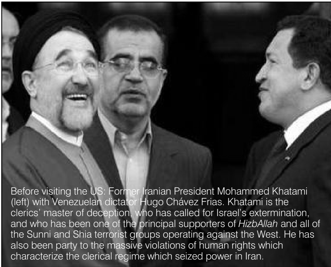
Before visiting the US: Former Iranian President Mohammed Khatami (left) with Venezuelan dictator Hugo Chávez Frias. Khatami is the clerics' master of deception, who has called for Israel's extermination, and who has been one of the principal supporters of HizbAllah and all of the Sunni and Shia terrorist groups operating against the West. He has also been party to the massive violations of human rights which characterize the clerical regime which seized power in Iran.

A Message to the American People, to Pres. George W. Bush, and to the US Congress: